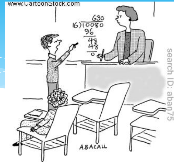
"I know how to divide. What I want to learn is how to divide and conquer. That could come in handy in one of my video games."