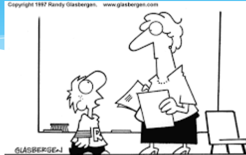
"I couldn't do my homework because my computer has a virus and so do all my pencils and pens."