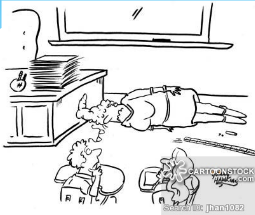
The day the entire 6 th grade class turned their homework in on time